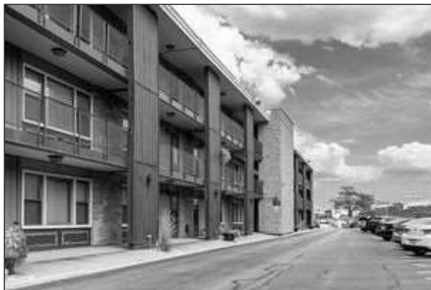
Some photos may be virtually staged